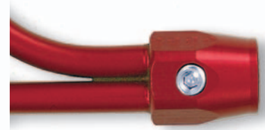
3/8 Female NPT Inlet

Other kits available. Please contact the sales office for details.