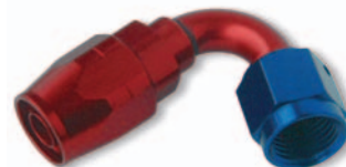
120° Dual Sealing Adjustable Swept Female