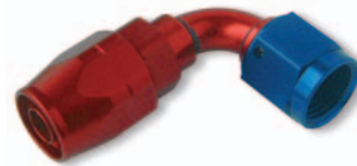
90° Dual Sealing Adjustable Swept Female