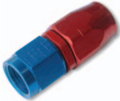
Straight Swivel Female