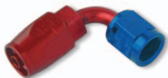
90° Swept Swivel Female