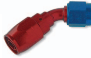
45° Dual Sealing Adjustable Swept Female