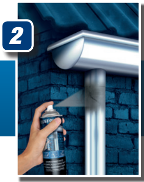
Apply product in multiple layers (after 30 minutes)